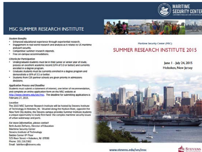
Figure 1. SRI 2015 Program Brochure

The Center has been able to track the academic and professional trajectories of its SRI program participants and has facilitated an active and engaged alumni network. The 2015 summer research program included 15 student participants representing the following five universities: Stevens Institute of Technology, University of Puerto Rico-Mayaguez, Brown University, Drew University and the University of Colorado-Boulder. 33% of the student participants were women and 20% were students from underrepresented communities. To support student participation in the 2015 program, the Center leveraged existing Stevens scholarship and fellowship programs and those of its academic partners to recruit students who could attend the SRI fully-funded through externally-funded sources. Ten out of the 15 program participants attended the program through funding support from the Stevens Scholars program and the Brazilian Scientific Mobility Program (BSMP), and one student attended using his own funding source.