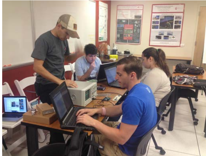
Figure 4. Students on the Underwater Acoustics Systems team conduct research to develop a mobile, modular passive acoustic monitoring system in the MSC Maritime Security Laboratory.

Table 4 below includes a list of the students and faculty mentors for the Underwater Acoustics Team. Details regarding the Team's project and research outcomes can be found in their final presentation slides located on the MSC SRI website at: http://www.stevens.edu/ses/SRI%202015 .