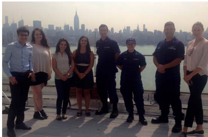
Figure 6: Students from the Magello Emergency Response Team meet with members from the USCG Sector New York Incident Management Division for a discussion on the tool's spill modeling capabilities for the New York Harbor.