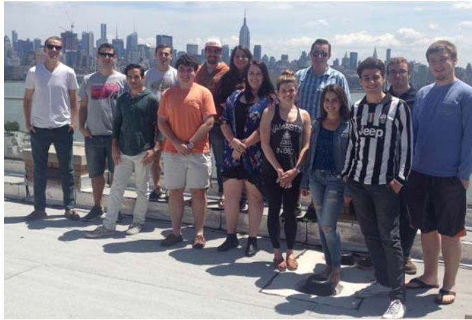
Figure 2. SRI 2015 student participants gather for a group photo on the MSCs 6 th Floor observation patio overlooking the Hudson River and west side of Manhattan.

Rico-Mayaguez and through a competitive admission process. The students admitted into the program were endorsed by their academic professors, expressed interest in homeland security concerns, and met the Center's admission criteria. Figure 2 shows a picture of the 2015 SRI participants and Table 1 identifies the participants and the funding sources leveraged to support their participation.