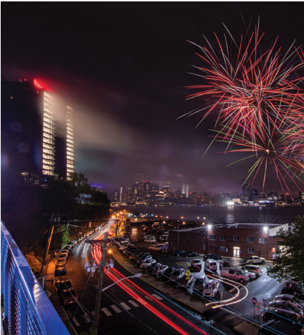
University Center Complex grand opening